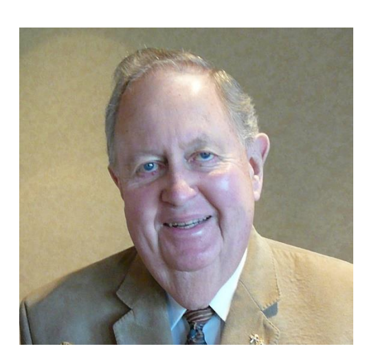
North Suburban Genealogical Society P.O. Box 3032, Glenview IL 60025